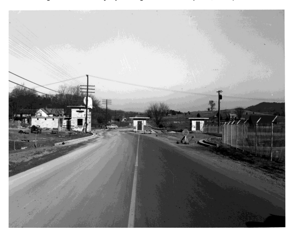
Construction of the "Checking Station" on the Oak Ridge Turnpike

World War II Secret City Gates (As published in The Oak Ridger's Historically Speaking column on April 5, 2006)