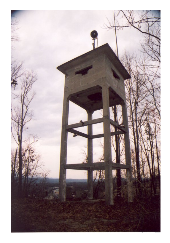
Close up view of the Observation Tower atop Pine Ridge