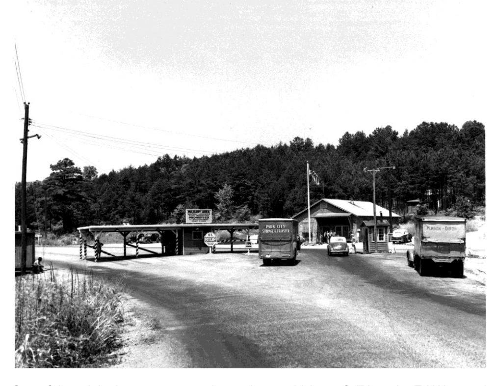
One of the original seven gates – do you know which one?